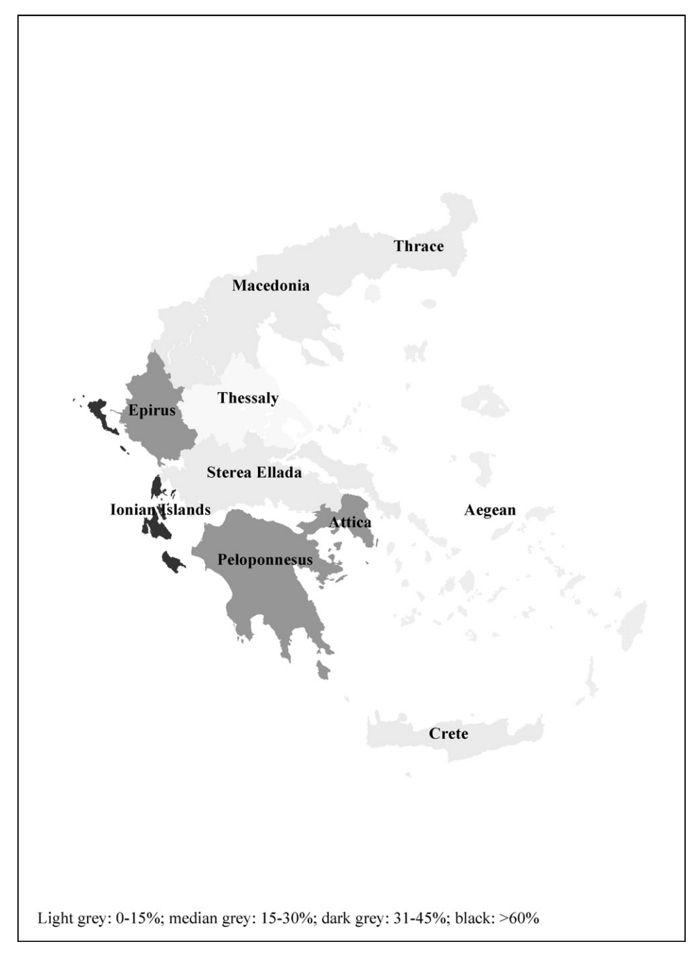
Fig. 1. Seroprevalence rates against pandemic H1N1 per Region of Greece.